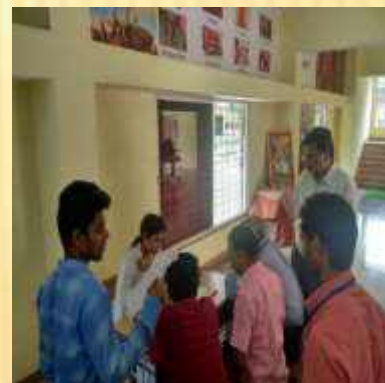
HEALTH CHECKUP CAMP at TRAINING CENTERS